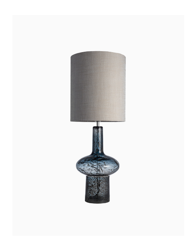
TABLE LAMP | VERDI INDIGO BLUE