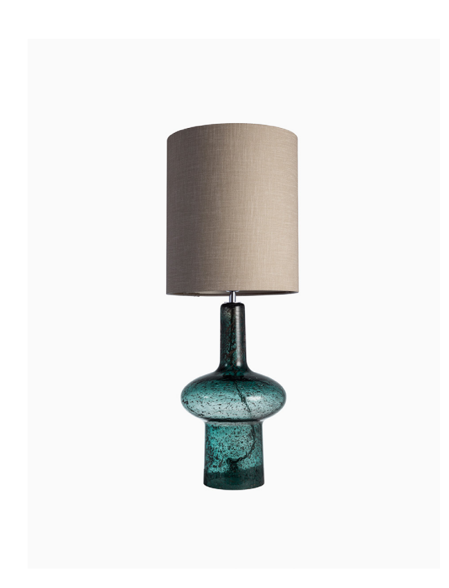
TABLE LAMP | VERDI OCEAN