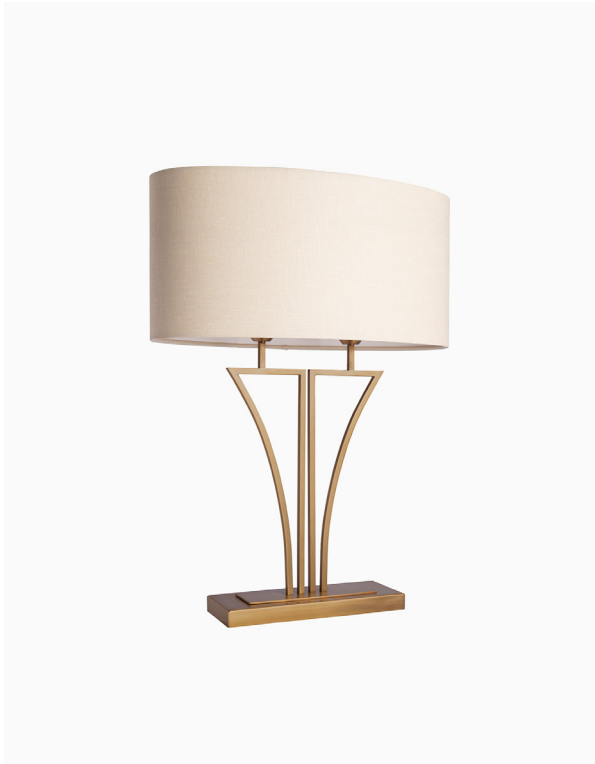
TABLE LAMP | YVES ANTIQUE BRASS