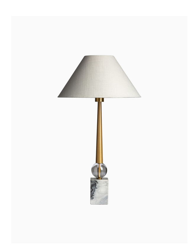
TABLE LAMP | TIVOLI ASH