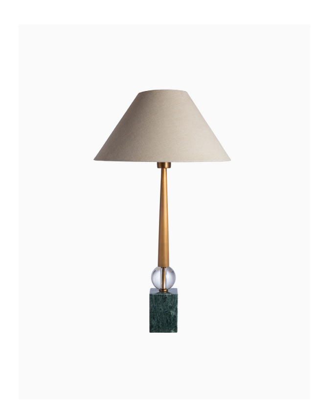
TABLE LAMP | TIVOLI VERDE