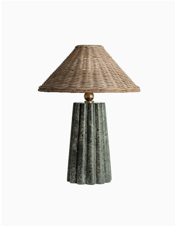
TABLE LAMP | SONNY