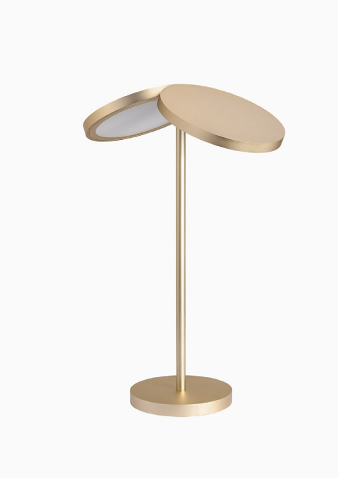
TABLE LIGHT | SAMARA