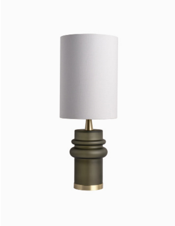
TABLE LAMP | SADIE