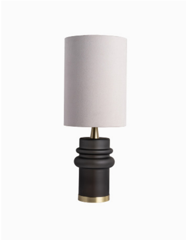
TABLE LAMP | SADIE