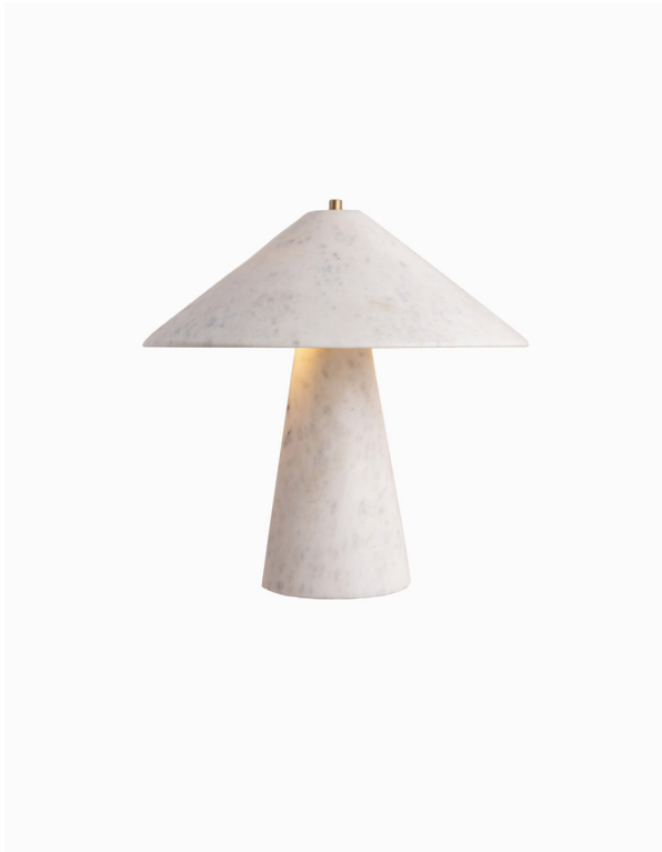
TABLE LAMP | RUBEN