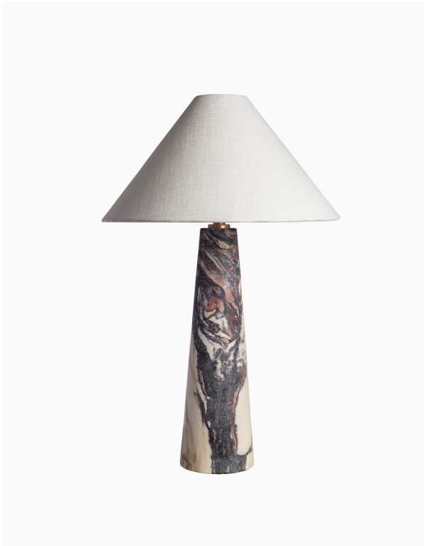
TABLE LAMP | ROSA