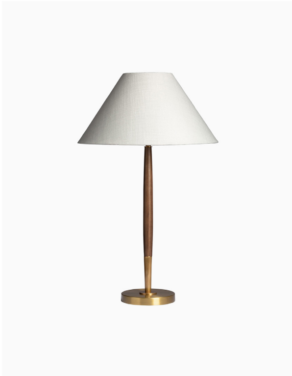
TABLE LAMP | RONNI