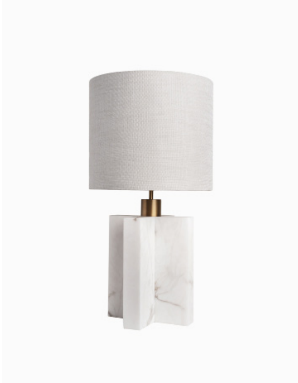
TABLE LAMP | QUINN