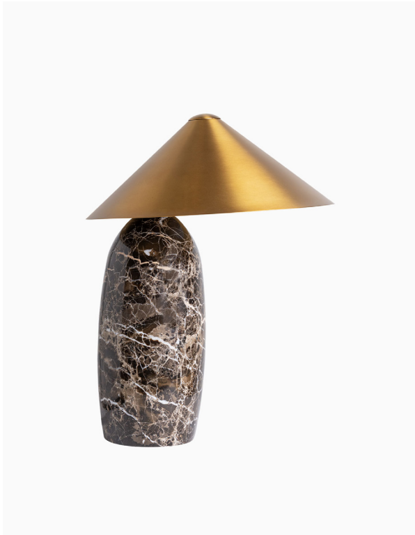
TABLE LAMP | PIPER