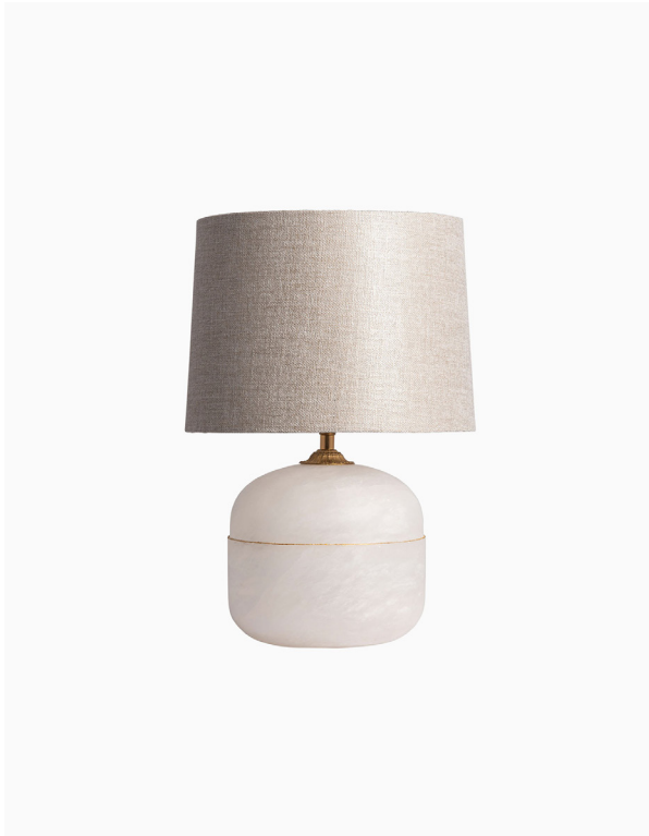
TABLE LAMP | PHOEBE