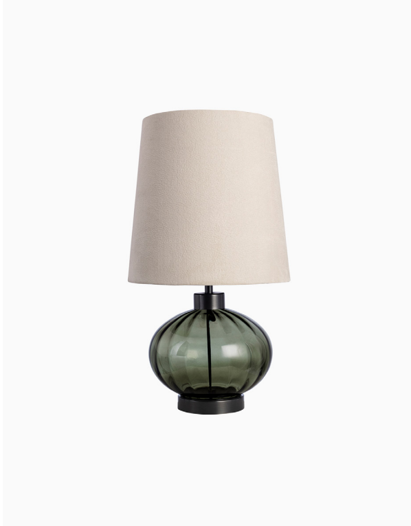
TABLE LAMP | PEDRA MOSS