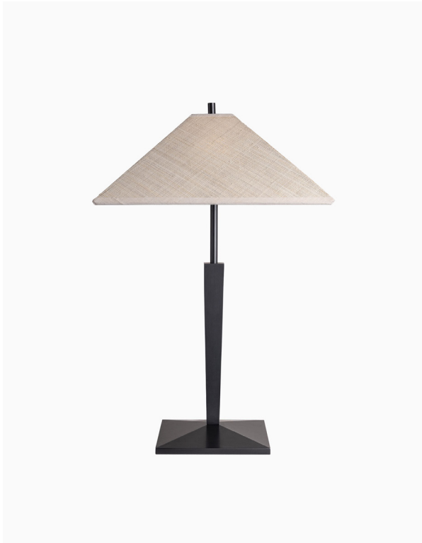
TABLE LAMP | PARKER