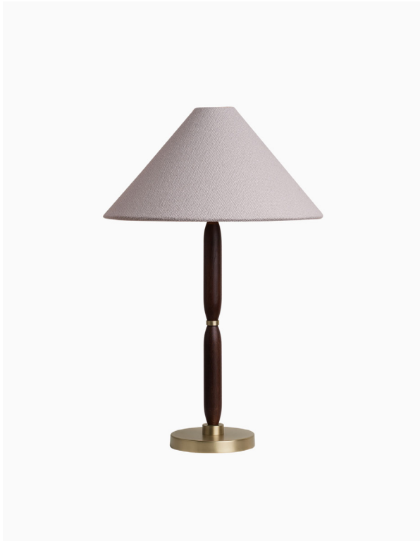
TABLE LAMP | PALOMA