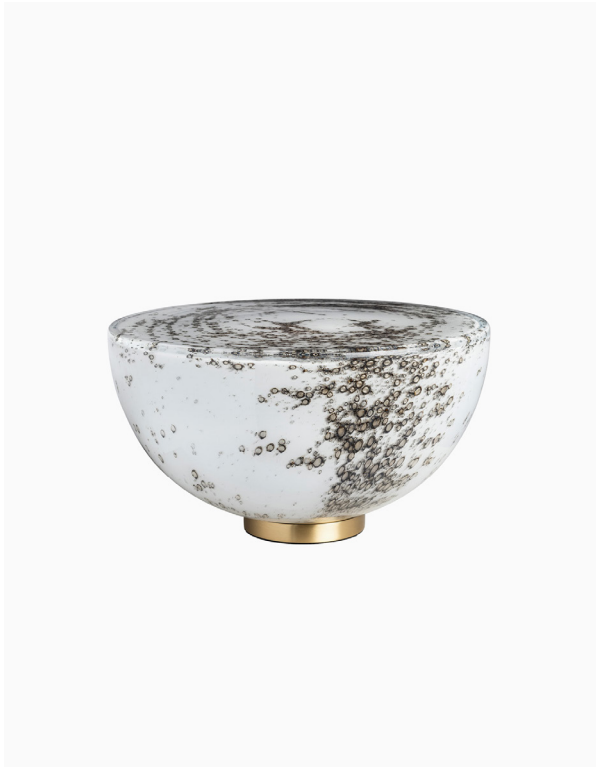
TABLE LAMP | ORLA SATIN BRASS