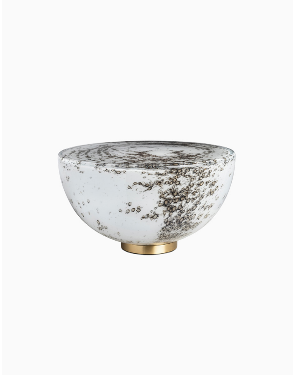
TABLE LAMP | ORLA SATIN BRASS