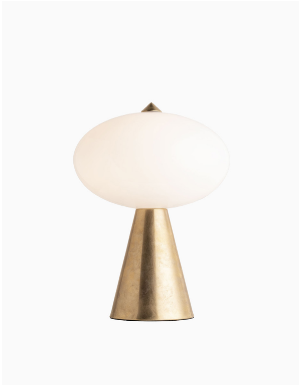
TABLE LAMP | NYX PORTABLE