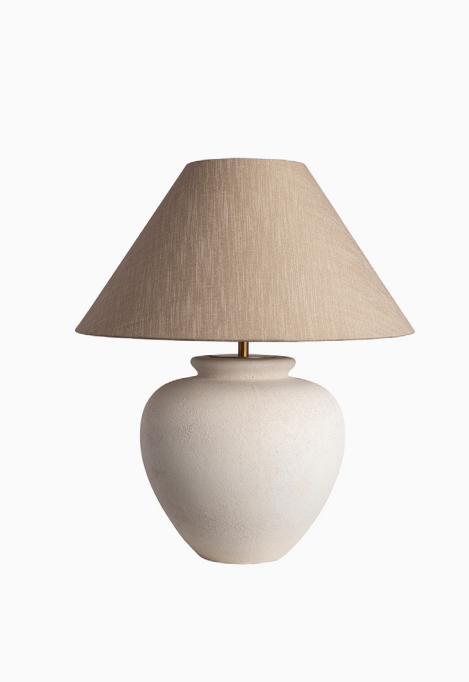
TABLE LAMP | NURI