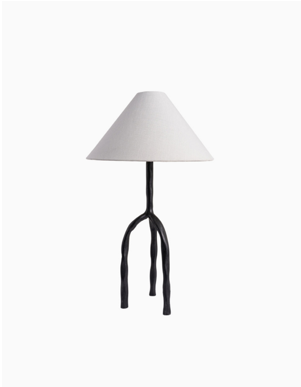
TABLE LAMP | NOOR SMALL