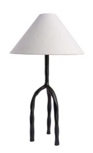
TABLE LAMP | NOOR SMALL