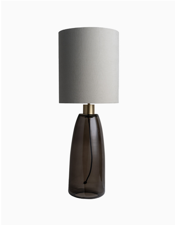
TABLE LAMP | NOMA