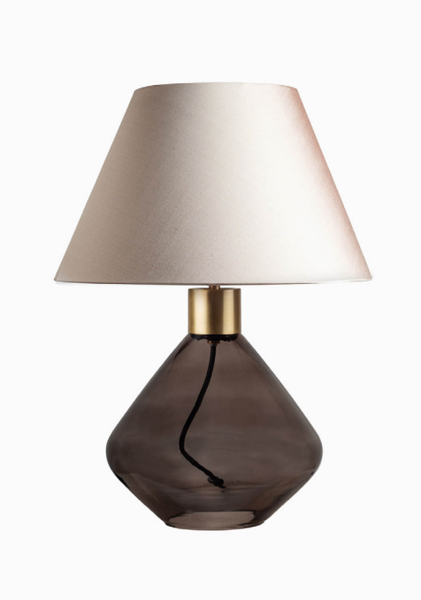
TABLE LAMP | NOA