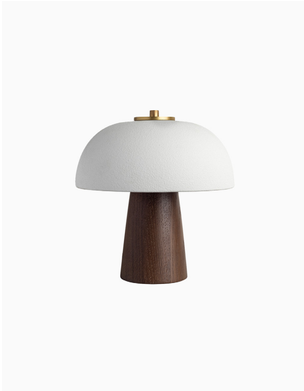
TABLE LAMP | NITA SMALL