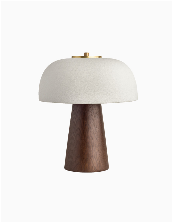
TABLE LAMP | NITA LARGE