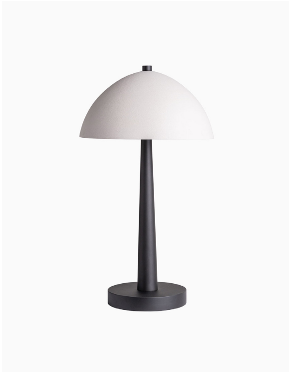
TABLE LAMP | NICO