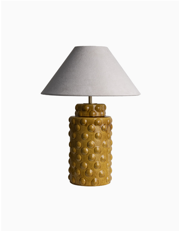
TABLE LAMP | MORRIS