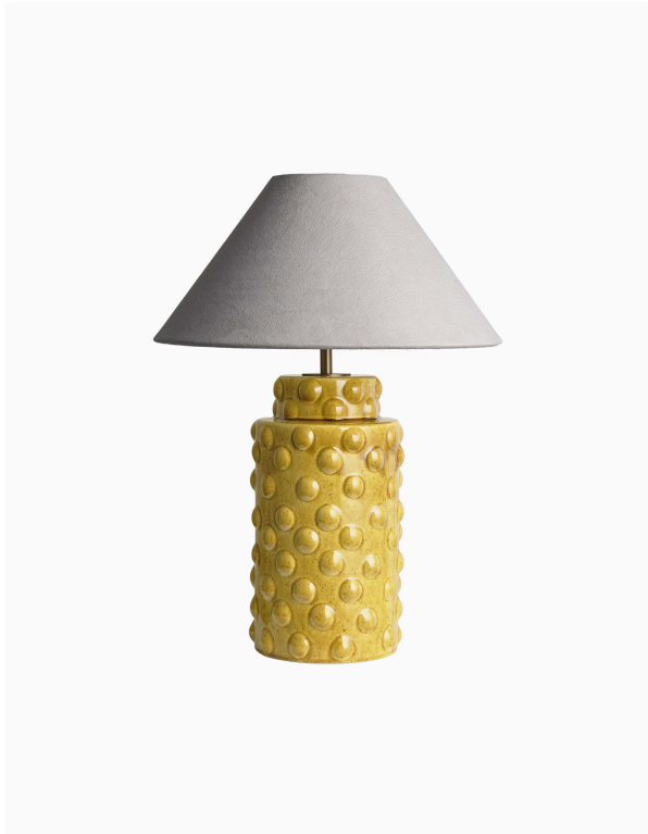
TABLE LAMP | MORRIS