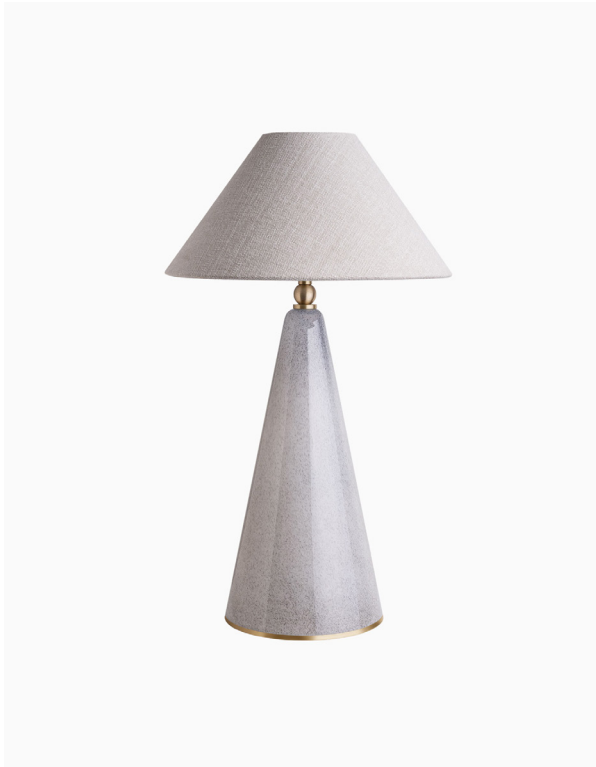
TABLE LAMP | MILA