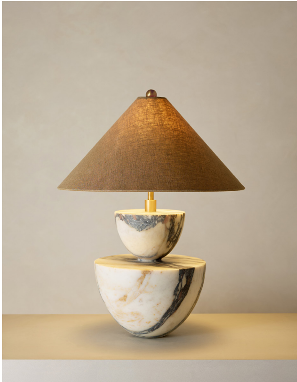
TABLE LAMP | MABEL