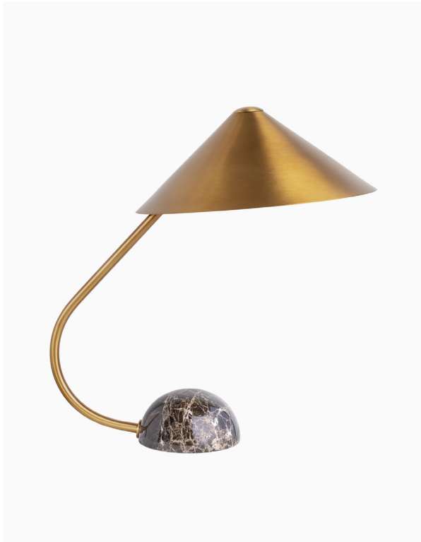
TABLE LAMP | LOIS