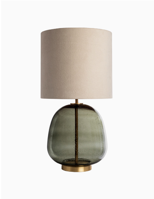
TABLE LAMP | ISLA OLIVE