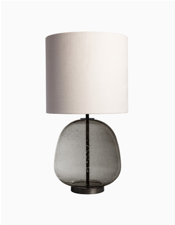
TABLE LAMP | ISLA SMOKE