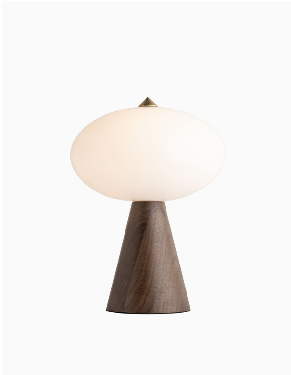
TABLE LAMP | EOS PORTABLE