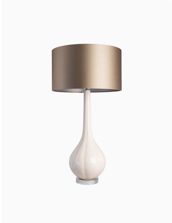
TABLE LAMP | ELENOR