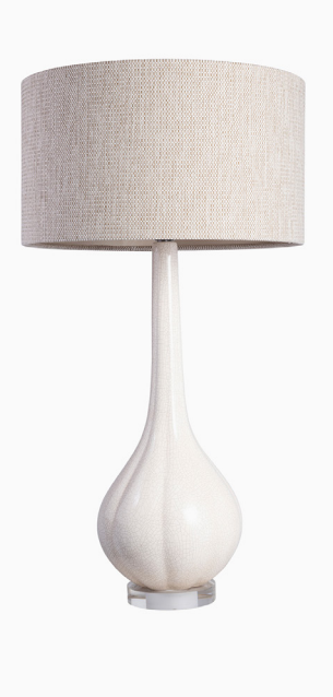
TABLE LAMP | ELENOR