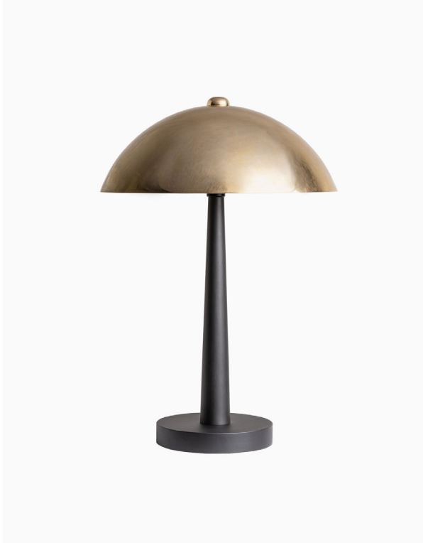
TABLE LAMP | DAWES