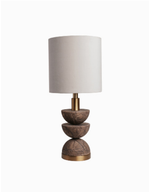
TABLE LAMP | CORA