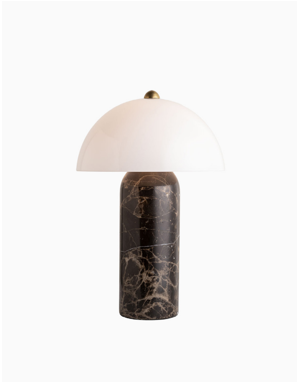
TABLE LAMP | CIRCE PORTABLE