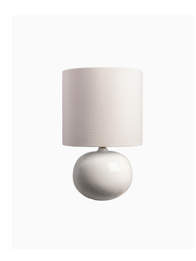
TABLE LAMP | CAMELLIA