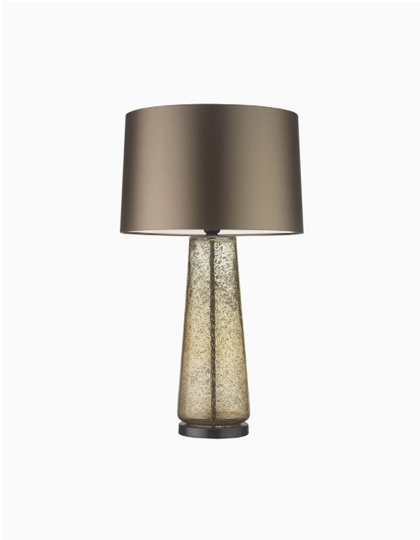
TABLE LAMP | CAIUS