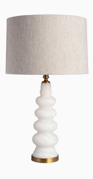
TABLE LAMP | BLANCA