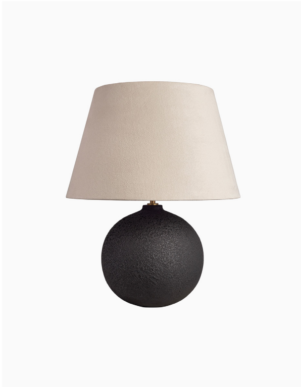
TABLE LAMP | AYDA