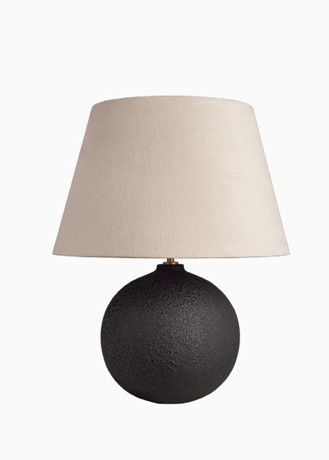
TABLE LAMP | AYDA