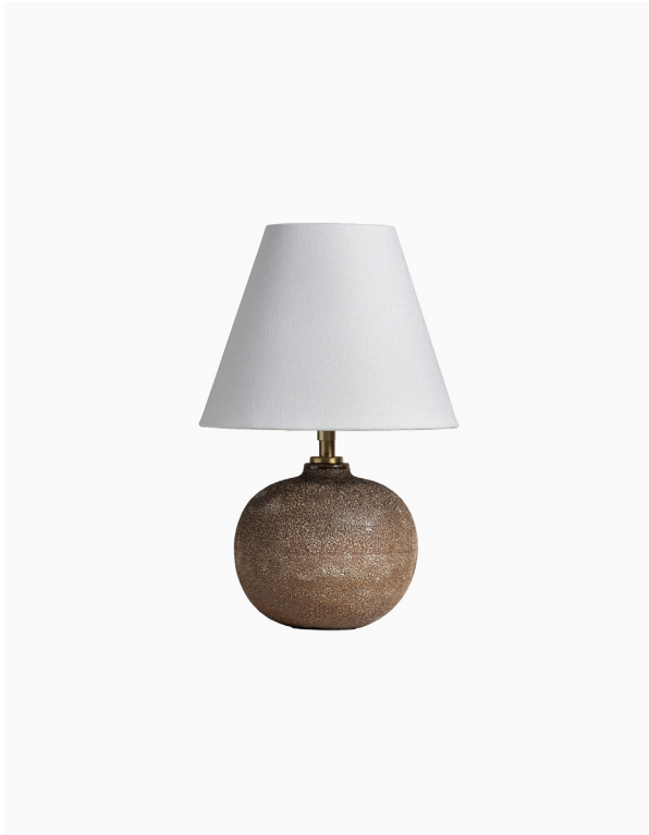
TABLE LAMP | AVANI MINI