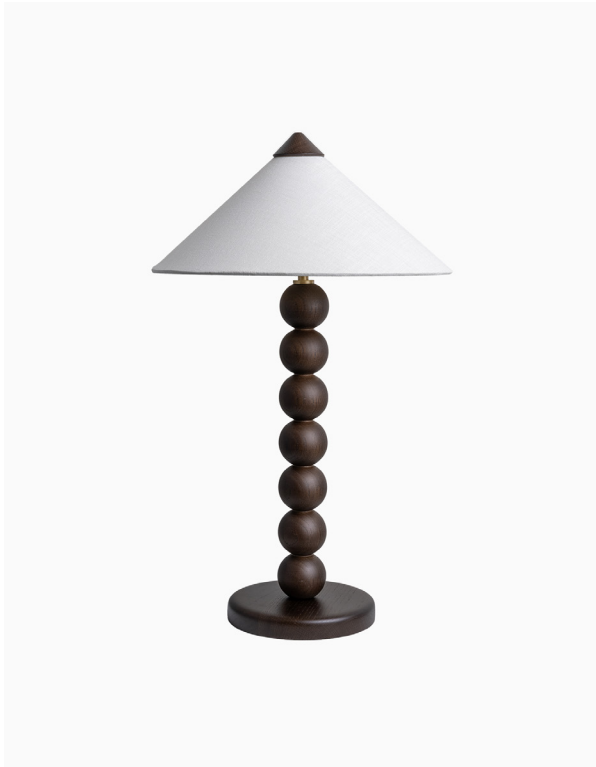
TABLE LAMP | ARCHIE