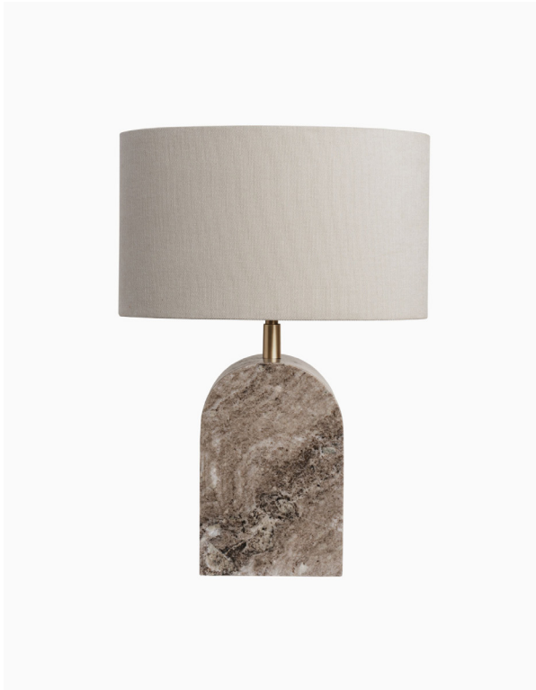
TABLE LAMP | ANAIS