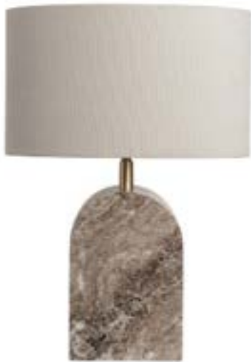
TABLE LAMP | ANAIS