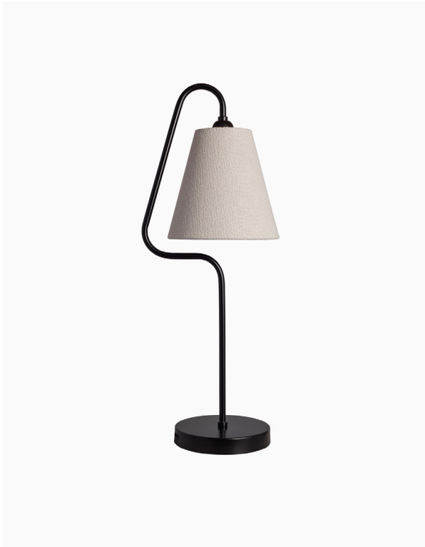
TABLE LAMP | ALFA