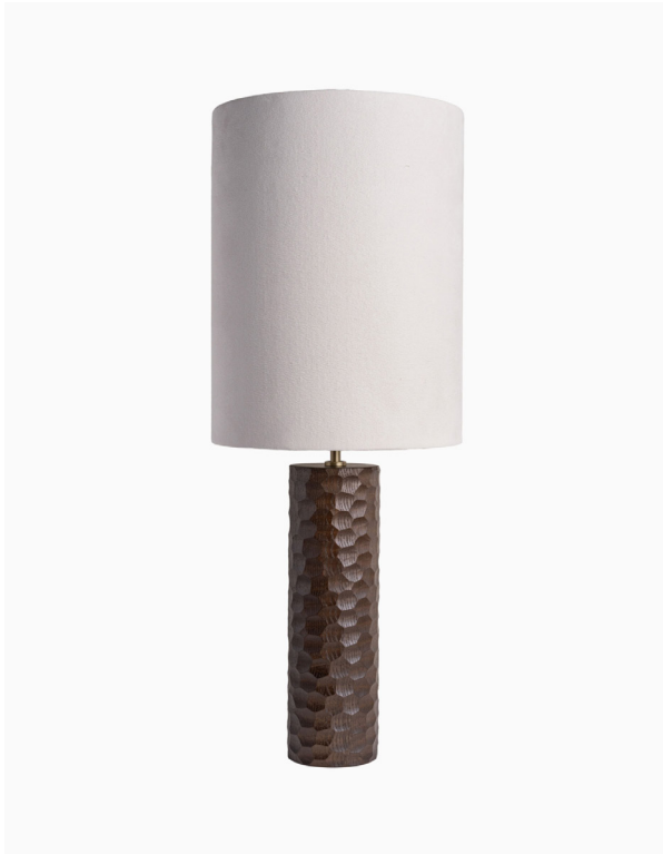
TABLE LAMP | ADLER