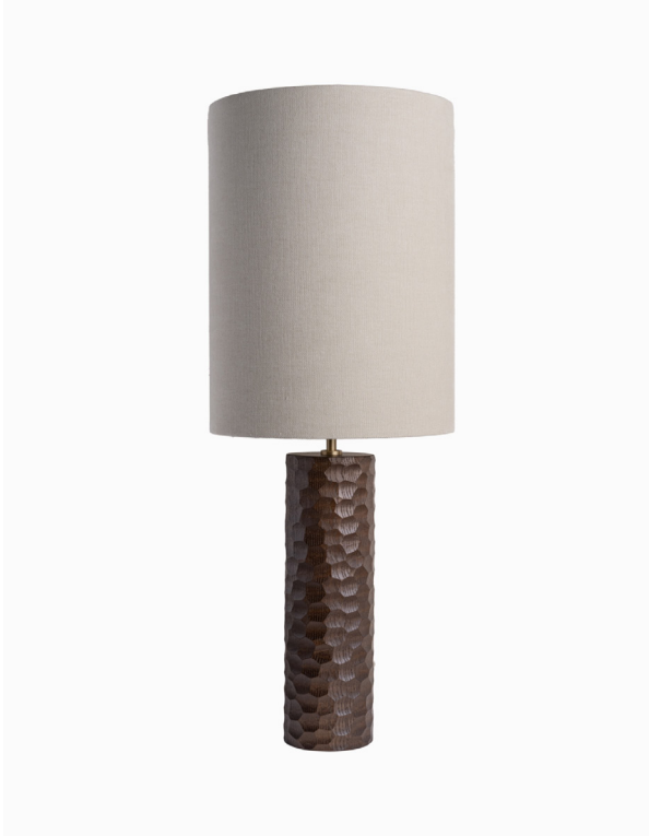
TABLE LAMP | ADLER